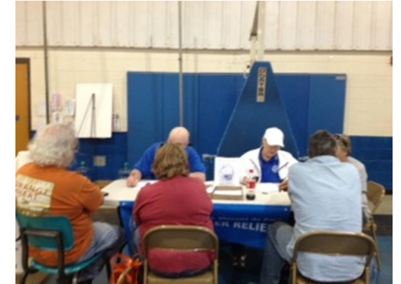
Disaster Case Management