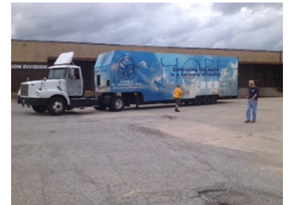
The Hope Kitchen