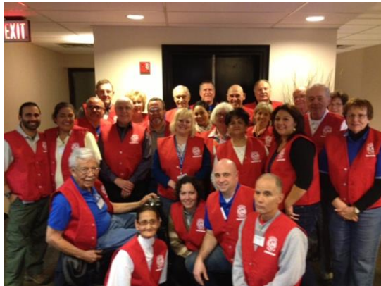
Rapid Response Teams/ Disaster Recovery Training