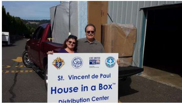
“House In A Box ® ”